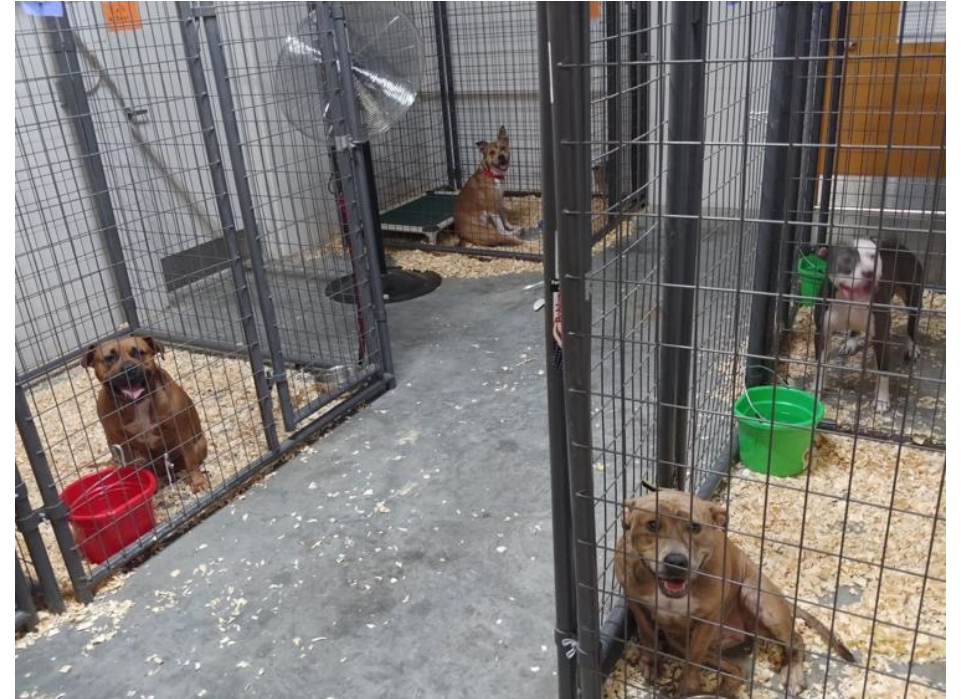
Vacant firehouse in Citrus County used for new arrivals while shelter was experiencing a disease outbreak