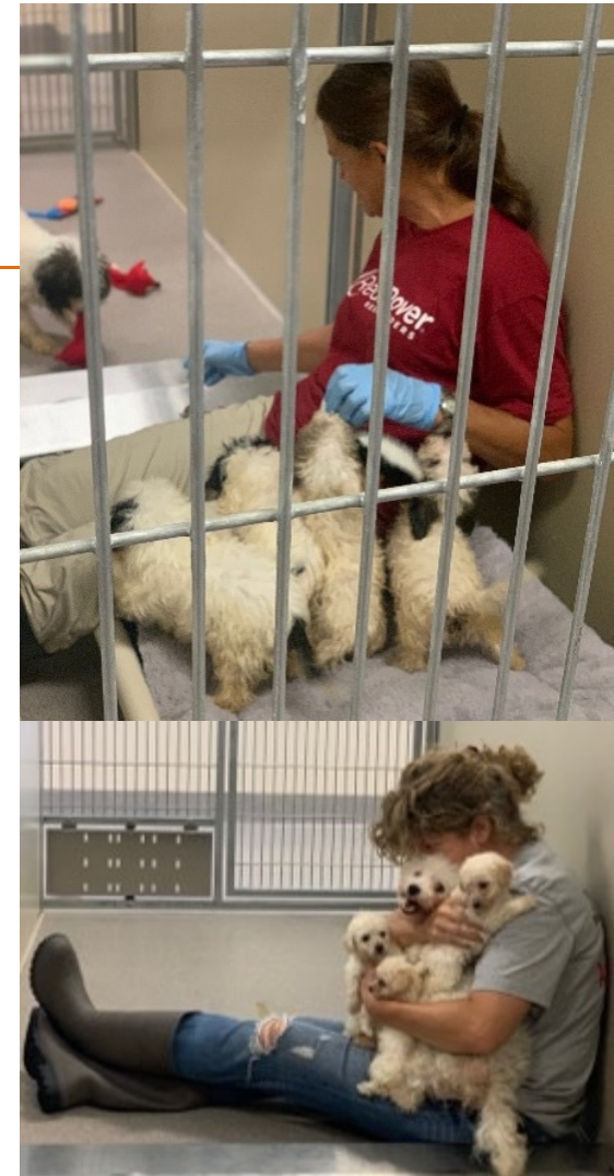
350 small breed dogs & puppies seized from breeding facility in 2019