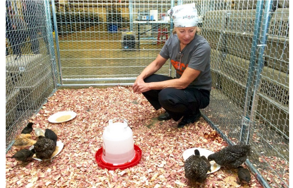
Above: co-housing chickens, photo courtesy of ASPCA FIR Team